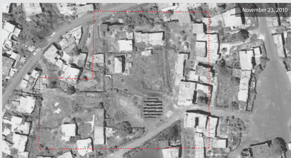
FIGURE 82. Damage to the Temple. Outer red line indicates the approximate extent of the temple.