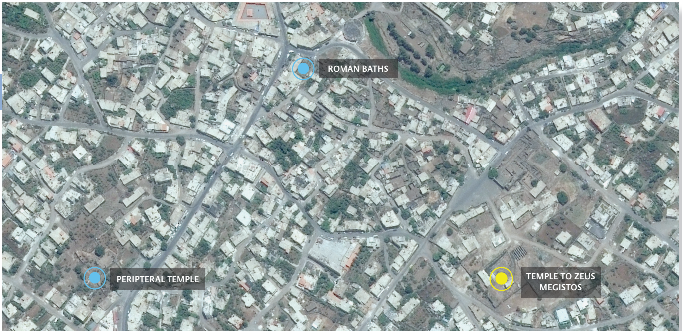
FIGURE 80. Overview of Qanawat and locations where damage has occurred and is visible.