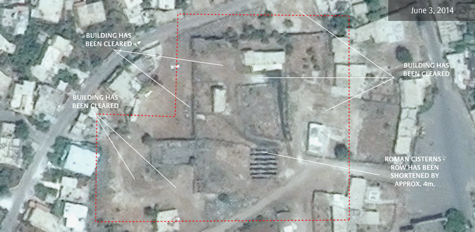
FIGURE 81. Damage to the Temple. Outer red line indicates the approximate extent of the temple.