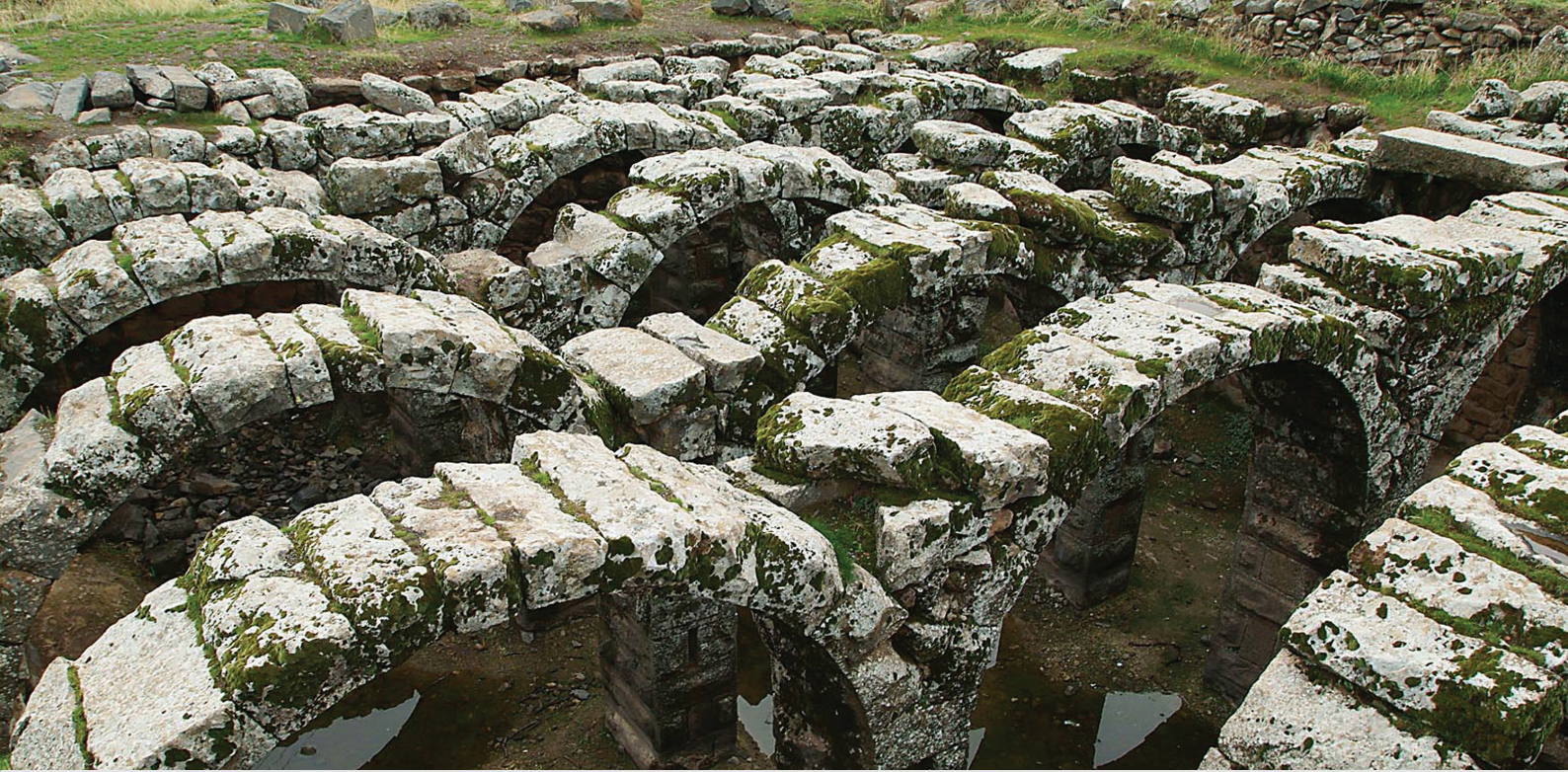
Roman cisterns in Qanawat as seen in the 03 June 2014 satellite image