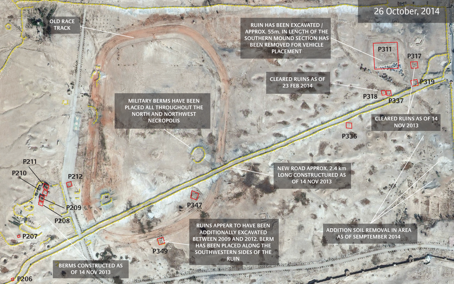
FIGURE 72. Northwest Necropolis.