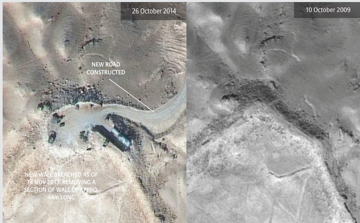
FIGURE 76 and 77. Old city walls and new road leading to 44-meter-wall breach caused by emplacement.