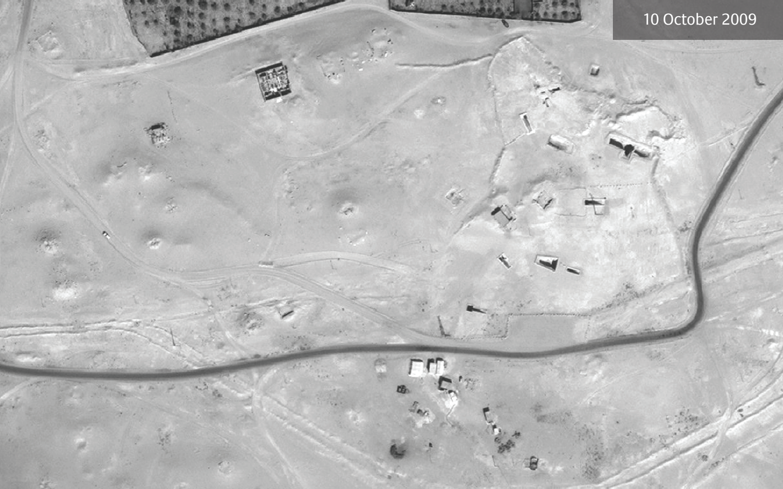
FIGURE 75. Location of tombs, open in 2009, and of later military emplacements.