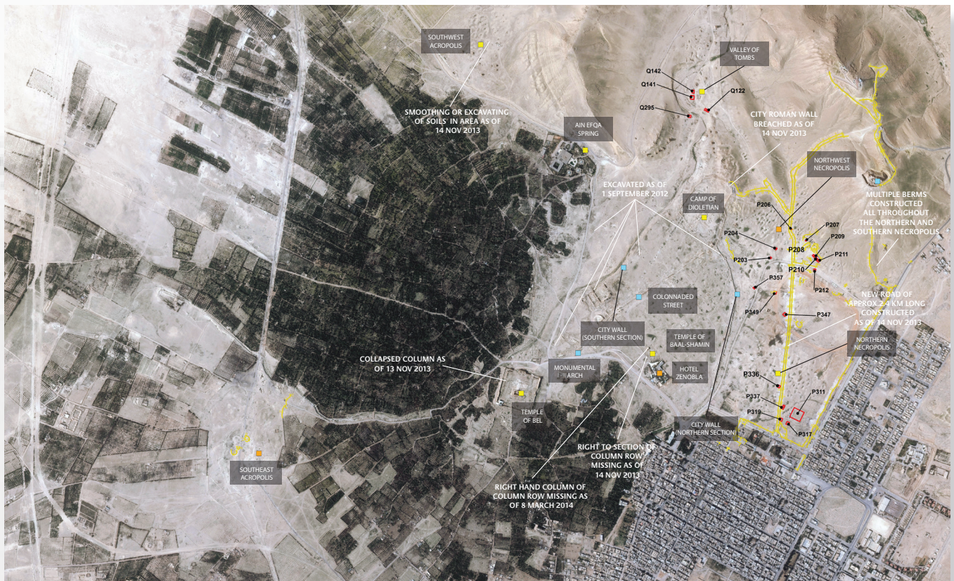
FIGURE 71. Overview of Palmyra and locations where damage has occurred and is visible.