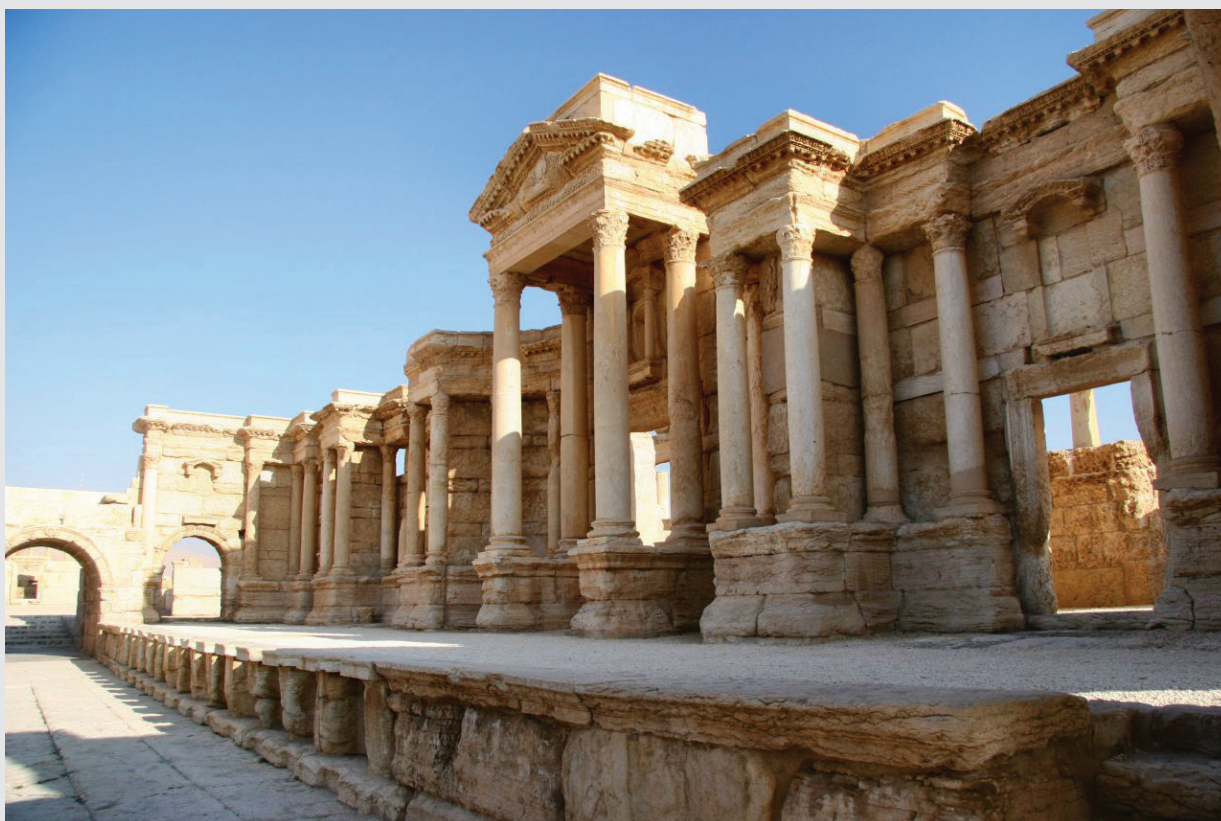
Theater of Palmyra/Photo: Wikimedia Commons.