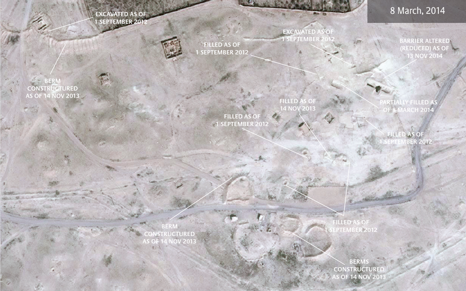
FIGURE 74. Tombs that were filled in as of 2012.