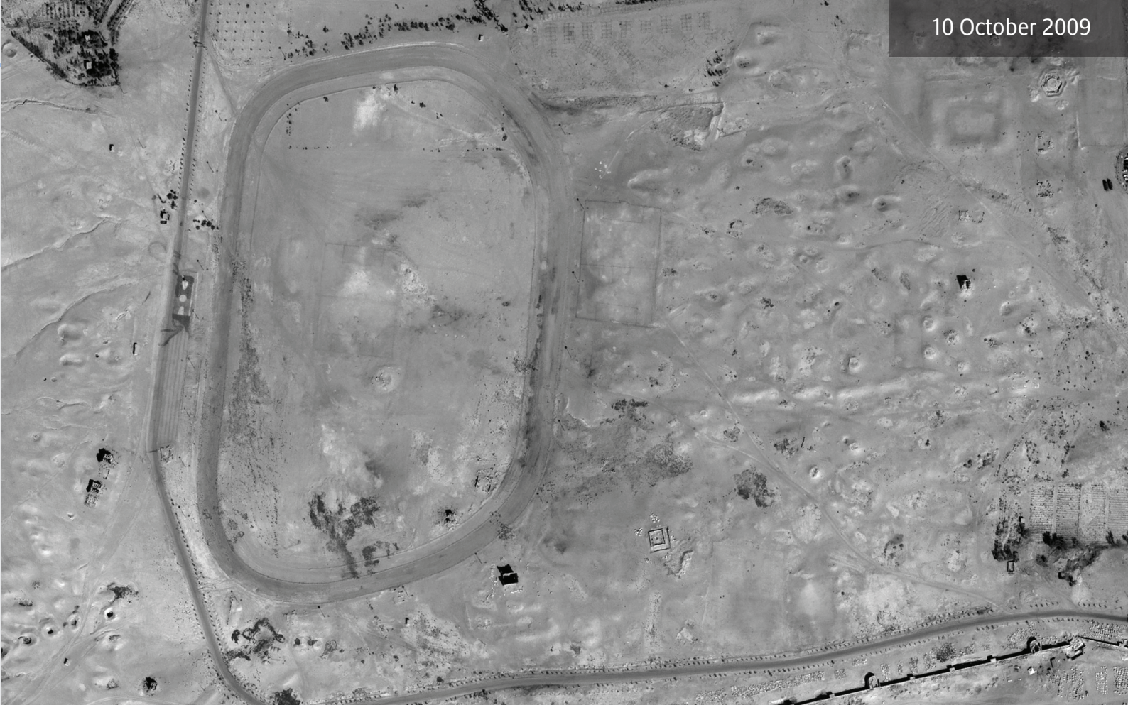
FIGURE 73. Northwest necropolis.