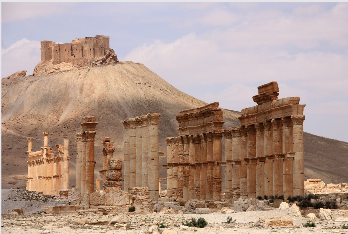
Remains of the Camp of Diocletian