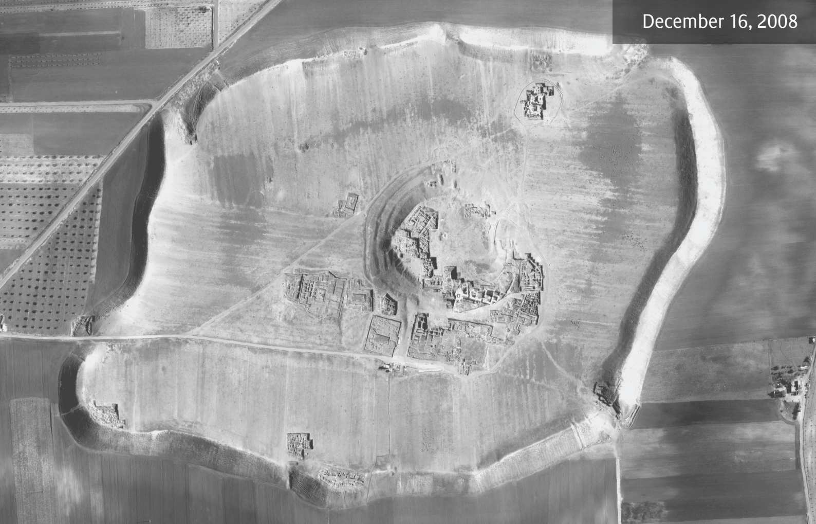
FIGURE 46. The Acropolis before damage.

The site was finally abandoned during the Roman imperial period. It has been excavated since 1965, and several sections have been reconstructed. A modern road bisects the site, running north-south, and a modern ticket booth, café and museum are located on the eastern part of the site.