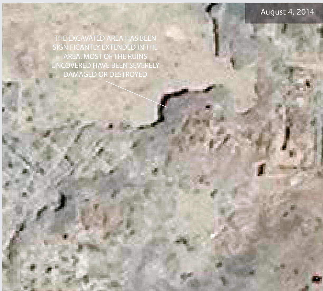
FIGURE 47. The excavated area has been significantly extended. Most of the uncovered ruins have been severely damaged or destroyed.