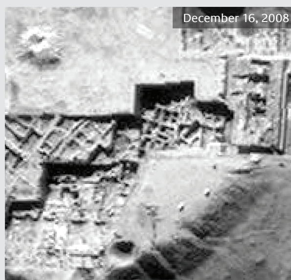
FIGURE 48. Area F before damage.

This area of Ebla has been heavily damaged. A comparison of the satellite imagery from December 2008 and August 2014 indicates that only the faintest traces remain of legitimately excavated features in this area. Furthermore, substantial parts of the acropolis around this area and extending south have been dug up, most likely with heavy machinery (see figures 47 and 48).