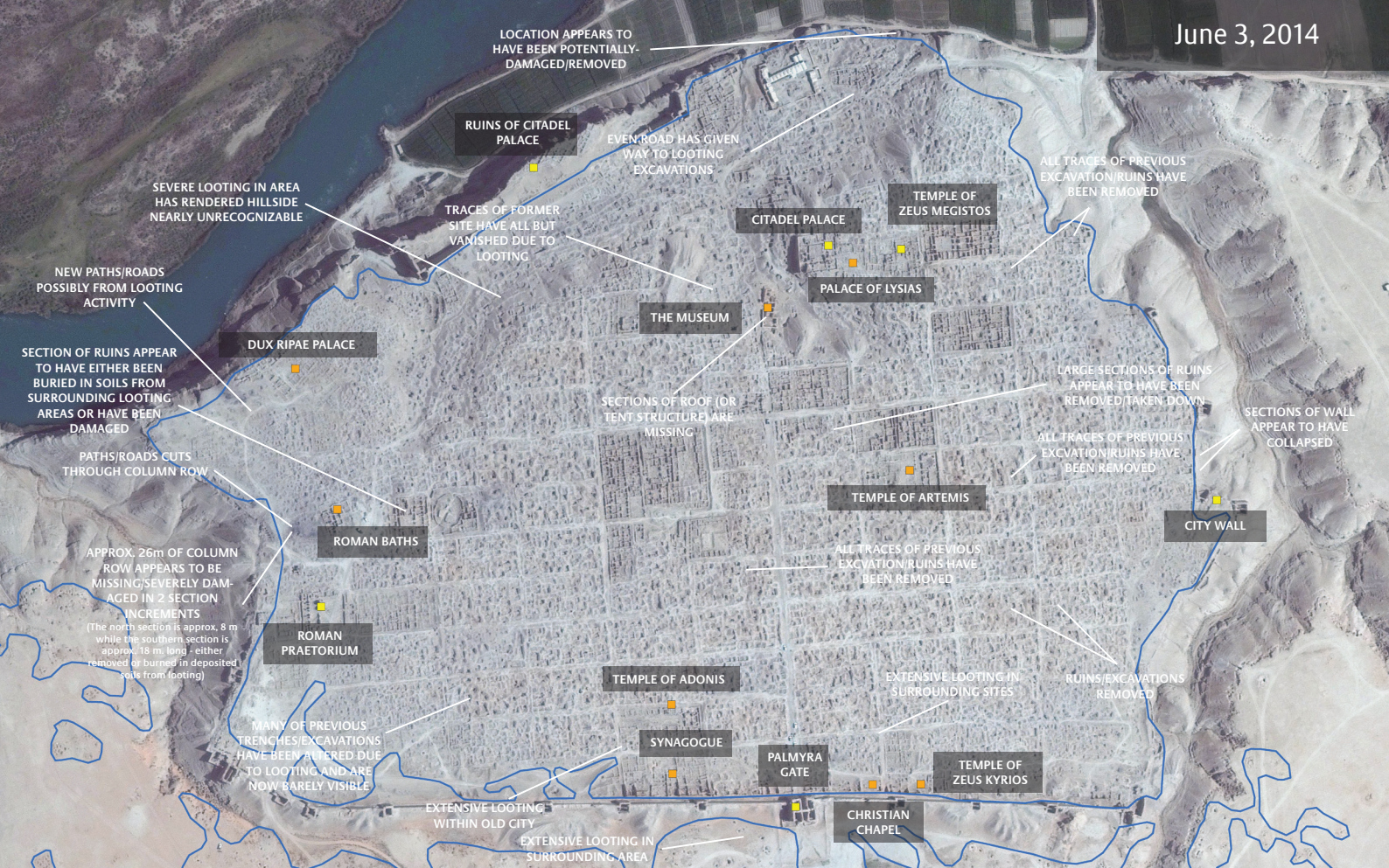
FIGURE 43. This image shows the damage in the area of the Palace of the Strategion/Old Citadel. Some ruins are completely removed and there are many looting holes around and inside the buildings. The looting holes have even removed the track. There is evidence of earth-moving machinery being used to excavate some areas (see Citadel Palace section). The damage to the museum is also visible (see The Museum section); one room has collapsed and most of the roof has been removed.

The site was submitted to the Tentative World Heritage List in 1999, but was resubmitted as a joint property with the site of Mari in 2011. Less than a third to a half of the city has been excavated so far.