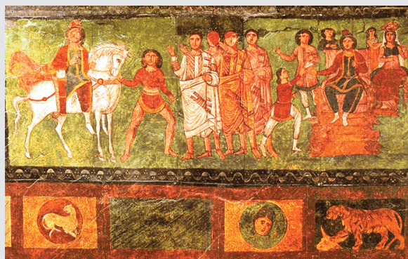
Part of the fresco at the Dura-Europos synagogue. This image illustrates a scene from the Book of Esther/ Photo: Wikimedia Commons.

Looting holes are apparent all over the site; almost no features remain. It is unknown whether they have been destroyed by looting holes or buried by disturbed soil.