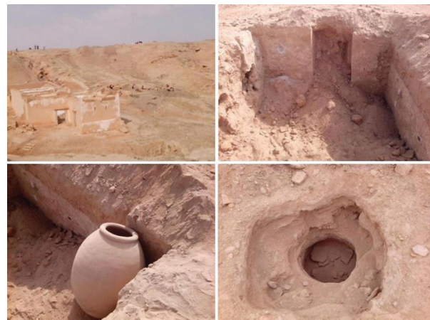
This image shows illegal excavations at Dura Europos/ Photo: Endangered Antiquities of Syria.

Large sections of the ruins have been removed, although rarely on the major features, destroying all traces of previous excavations (see figure 40). A small section of the city walls has collapsed. Some areas are now almost unrecognisable; for instance, some paths have been dug to such an extent that they are no longer visible (see figures 41 and 42). Unfortunately, no area of the site is unaffected. (vi) A small museum containing replicas was present on the site; the roof has been removed and some walls are damaged). No damage was visible at the dig house, (vii) but the ground around it has been heavily disturbed. Several vehicles were also visible on the site. It should be noted that the city is largely made of mud-brick which requires regular conservation to prevent degradation. This has not been possible during the conflict, so degradation of the structures is likely.