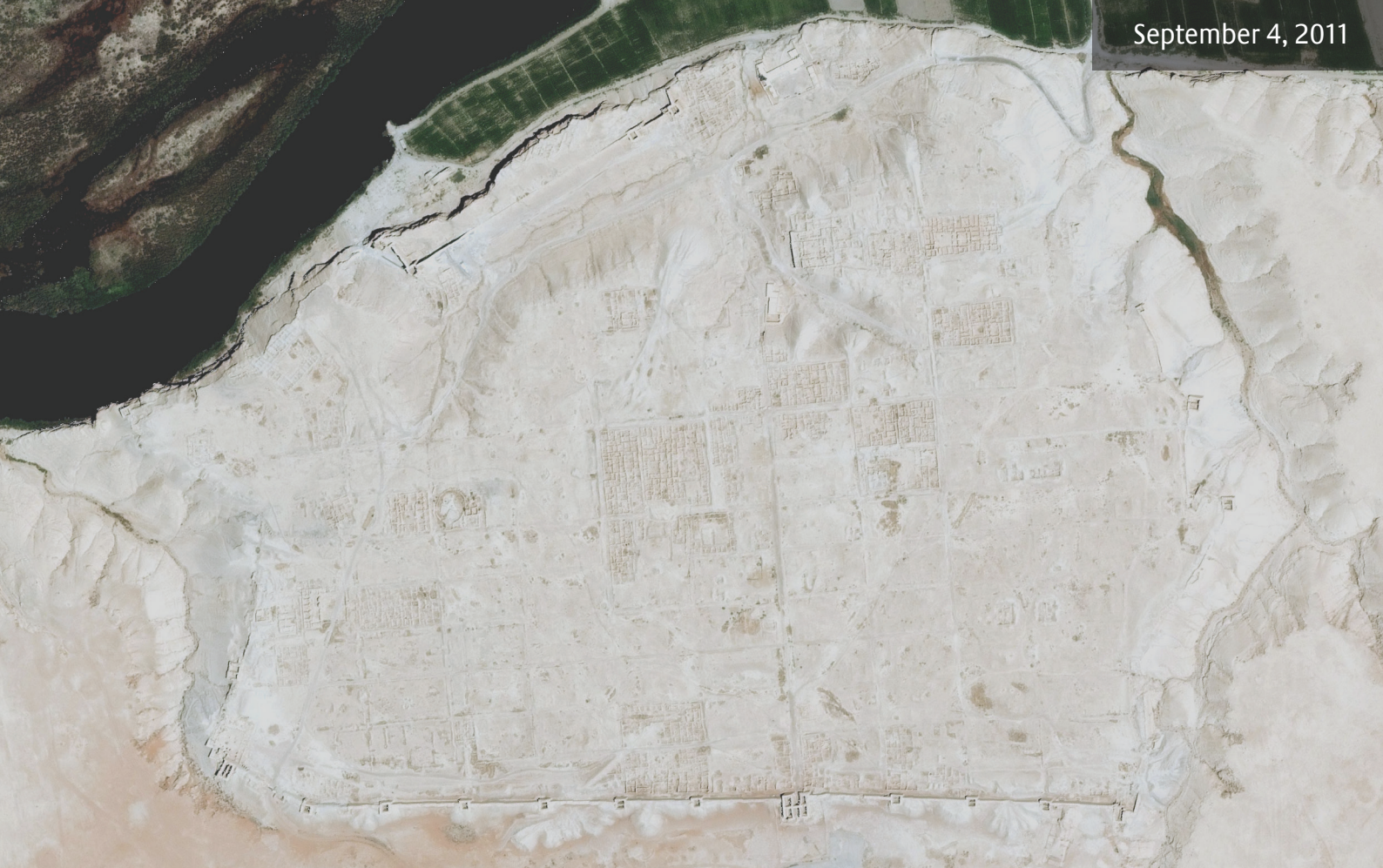
FIGURE 44. This image shows the area of the Palace of the Strategos/Old Citadel and the museum before extensive damage occurred.

Large sections of the ruins have been removed, although rarely on the major features, destroying all traces of previous excavations (see figure 40). A small section of the city walls has collapsed. Some areas are now almost unrecognisable; for instance, some paths have been dug to such an extent that they are no longer visible (see figures 41 and 42). Unfortunately, no area of the site is unaffected. (vi) A small museum containing replicas was present on the site; the roof has been removed and some walls are damaged). No damage was visible at the dig house, (vii) but the ground around it has been heavily disturbed. Several vehicles were also visible on the site. It should be noted that the city is largely made of mud-brick which requires regular conservation to prevent degradation. This has not been possible during the conflict, so degradation of the structures is likely.