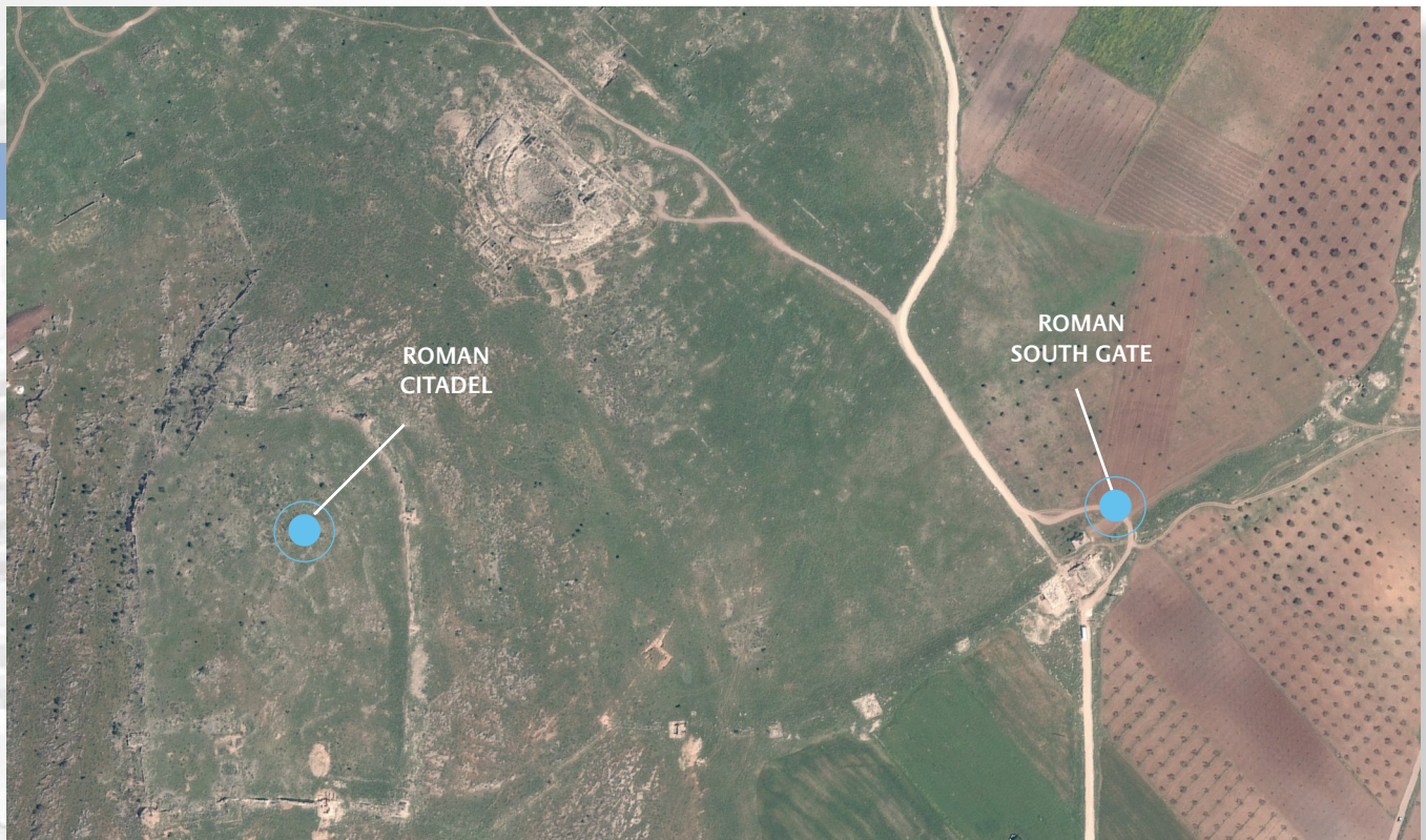
FIGURE 33. Overview of Cyrrhus and locations where damage has occurred and is visible.