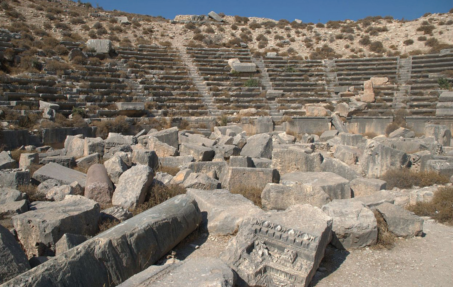
Roman theatre in Cyrrhus