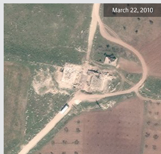
FIGURE 35. Creation of a trench at the South Gate of Cyrrhus (4 x 7m).

The imagery indicates that a small trench measuring 4 x 7 m has been dug on the southeast side of the gate, indicating possible looting (see figure 34 and 35). It is unclear how this trench has affected the gate itself.