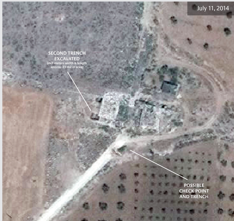
FIGURE 34. Creation of a trench at the South Gate of Cyrrhus (4 x 7m).