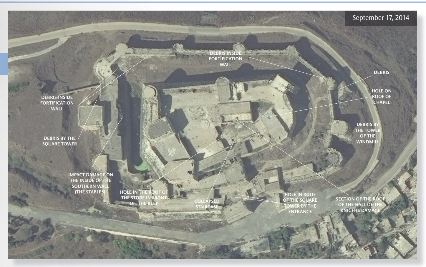
FIGURE 31. Overview of Crac des Chevaliers and locations where damage has ocurred and is visible.