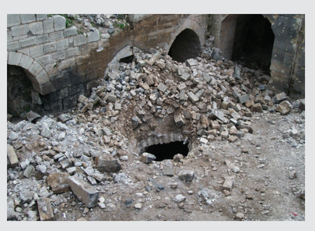
Image of the inner courtyard where the stairs have completely collapsed/Photo: DGAM, 03 July 2014