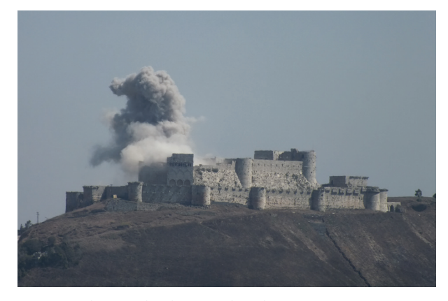
Crac des Chevaliers Video is available at:

The castle itself has also sustained damage. There are holes in the roof of the square tower by the entrance, the eastern tower of the donjon (keep), the roof of the store in front of the keep and the chapel (which still contains traces of medieval frescos). In addition, the Gothic loggia, also known as the Hall of the Knights, is clearly damaged; a section has collapsed and debris is visible in the courtyard in front of it. The court-