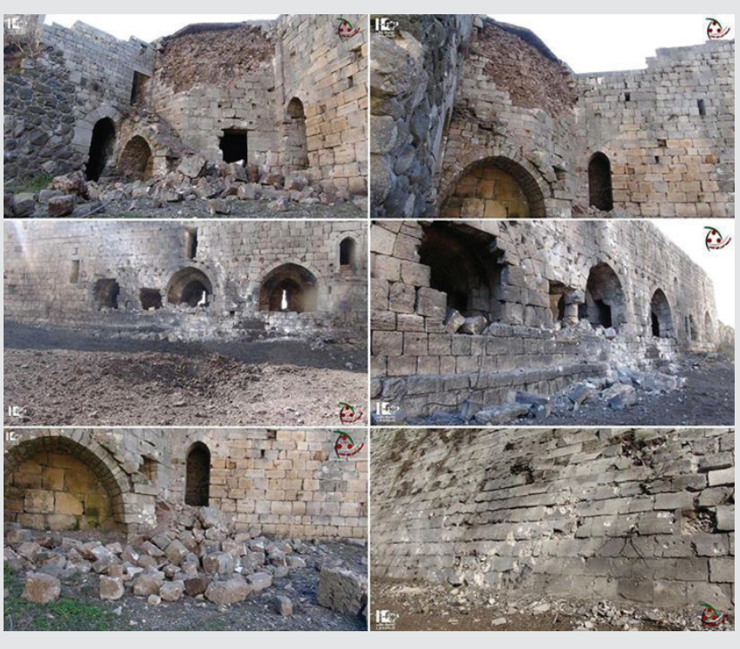
Effects of bombings on the citadel, 19 February 2014